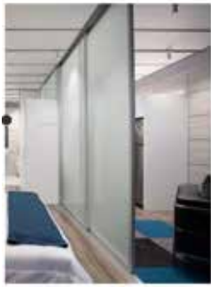
Sliding Privacy Wall