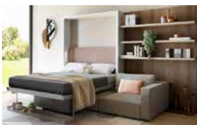
Roll-out Queen-Size Bed

While studios homes provide the ultimate in “lock and leave” convenience, they tend to be pretty basic: a bed, a bathroom and a mini-kitchen with a table. That’s the past, but what does the future studio look like?