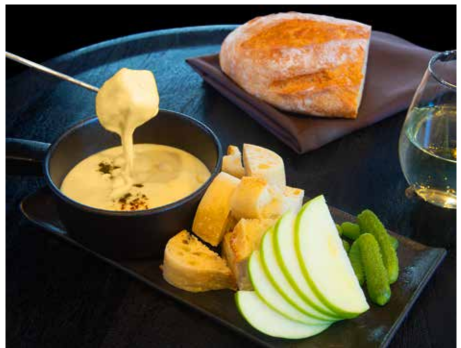
Swiss Fondue is a rich harmony of Gruyere, Emmentaler and pinot blanc coupled with pear and house-made brot.

serves an impressive array of local German and Bavarian style craft beers and top