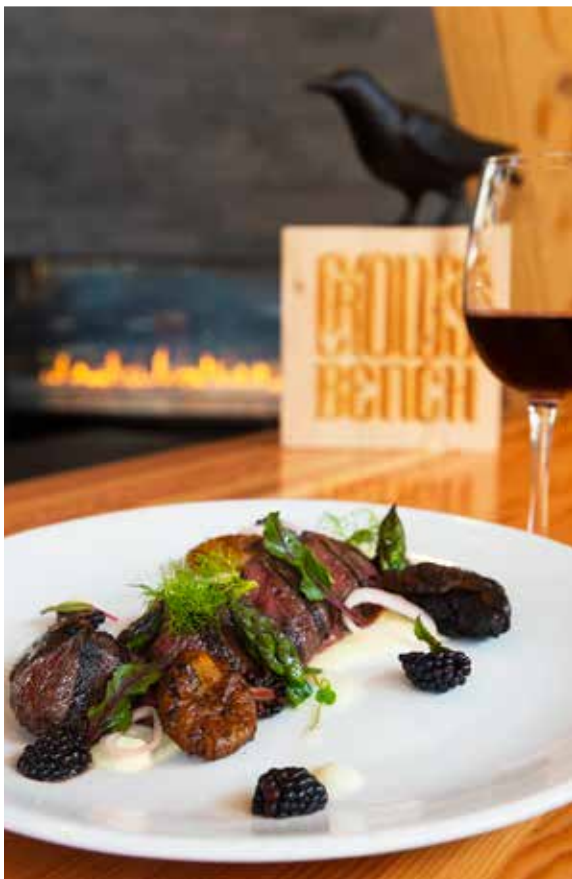
Top: Creatively crafted cocktails accompany a Charcuterie of Jamon Iberico, Grand Cru cheddar, Tete des moines, Chambere, Humbolt fog, Bavarian sausage, cornichons and piquillo peppers. Bottom: Elk Loin with gremolata.

Immersed in a visual festival of massive timbers, huge glass expanses and a commanding floor-to-ceiling fireplace, guests at Humbird's Crow's Bench restaurant and lounge are set to be treated to a culinary sojourn not soon forgotten.