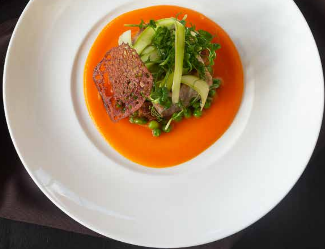
Seared Sturgeon draped with a ginger-carrot puree, Jamon lardons, English peas, asparagus salad and Ardenne gastric. Dazzling Beet Carpaccio is a savory union of pickled blackberries, carrots, pea tendrils and lemon goat cheese cream.