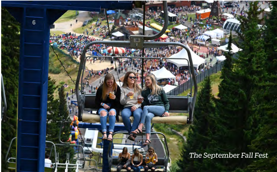
The September Fall Fest

Finally, you won’t want to miss our two very popular and highly spirited summer events: July’s Northwest Wine Fest, featuring 80 wines, five bands plus BBQ’d treats, and The September Fall Fest, showcasing more than 80 beers, ciders and seltzers plus lively live music. Visit schweitzer.com for dates, tickets and information.