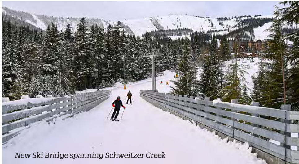
New Ski Bridge spanning Schweitzer Creek